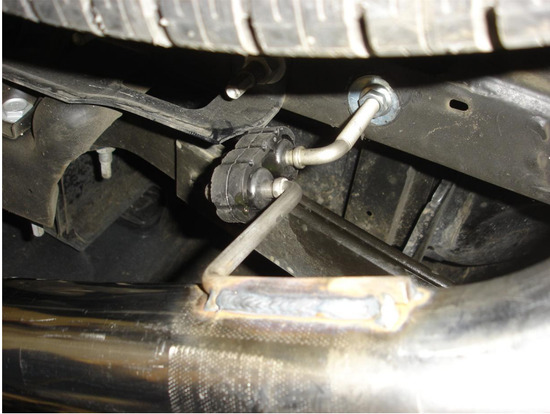
Fig # 1 Passenger Side

Step 3: Once a final position has been chosen for the new system, evenly tighten all fasteners from front to rear. The supplied band clamps must be VERY tight to properly align the pipes and prevent leaks (Approximately 40ft-lbs). U-bolt clamps should be tightened to approximately 30-35ft-lbs. Inspect all fasteners after 25-50 miles of operation and retighten if necessary.