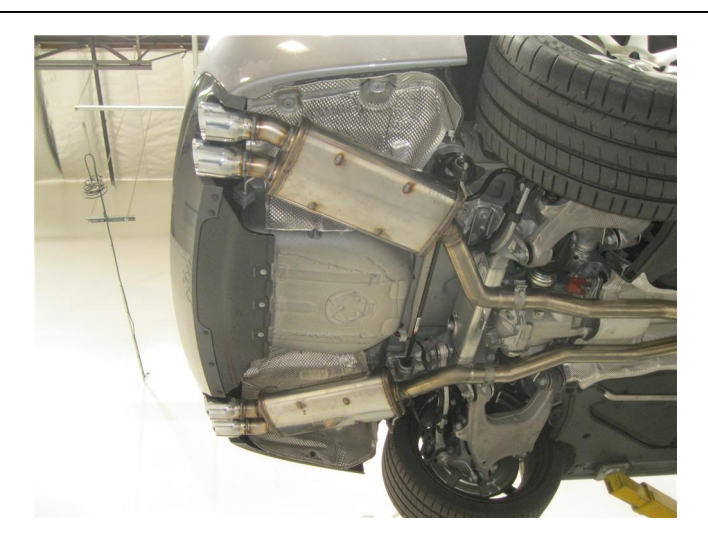
Step 4. Finish by installing both Muffler Assemblies using the supplied clamps, fitting the hangers into the rubber insulators and re-attaching the cross brace.