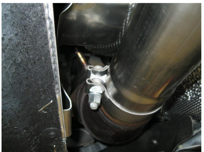
Step 2. Begin installation of the new system by fastening the Inlet Pipe to the outlet of the catalytic converter using the supplied 3.00" clamp.