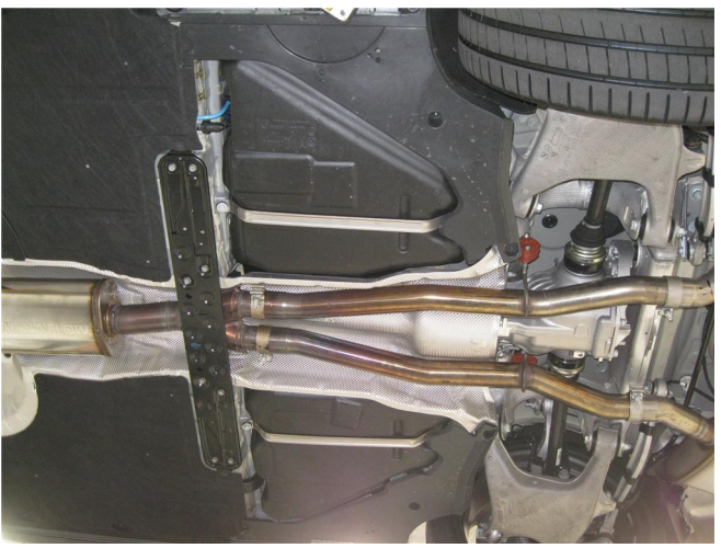
Step 3. Next attach the Resonator Assembly to the Y-Pipe Assembly followed by the two Mid-Pipe assemblies, use supplied clamps and fit hangers into rubber insulators.