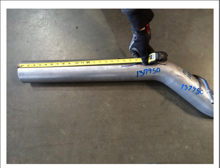
Step 3. The inlet end of the Mid Pipe Assembly may need to be trimmed depending on the year and cab configuration of your vehicle.

'01 - '05 Extended Cab: Cut 9.00" '06 - '07 Extended Cab: Cut 11.00" '06 - '07 Crew Cab: Cut 4.00" '01 - '05 Crew Cab: DO NOT CUT