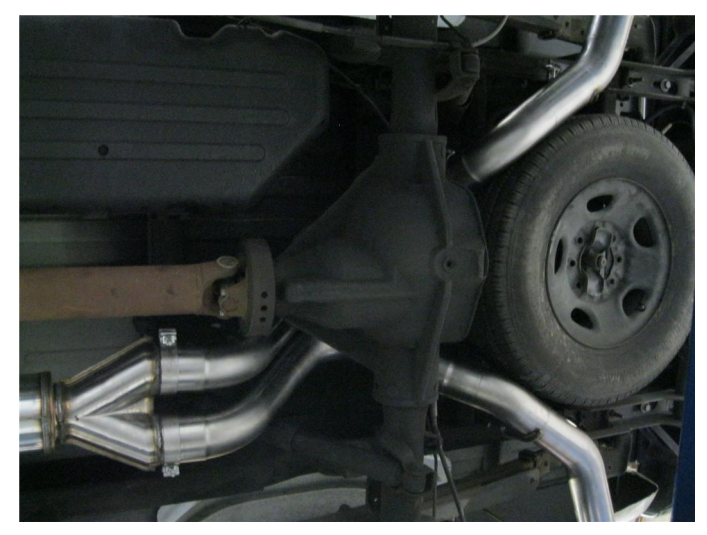
Step 6. Install both Over Axle Pipe Assemblies and the Tail Pipe Assemblies in a similar fashion.