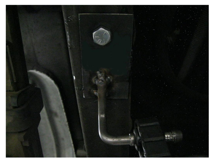
Step 7. For the Drivers Side Tail Pipe Assembly you will need to attach one of the supplied hangers. Bolt the supplied hanger bracket (shown) to the vehicles sub frame for year range '06 - '07. The threaded hanger is for year ranges '01 - '05. Both are mounted with the supplied hardware. Now engage the supplied hanger rubber to the newly mounted hanger and the welded hanger on the Tail Pipe Assembly.