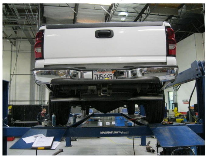
Step 6. Once a final position has been chosen for the new exhaust system, evenly tighten all clamps from front to rear using the torque specifications on page one of the instructions. Inspect all fasteners after 25-50 miles of operation and re-tighten if necessary.