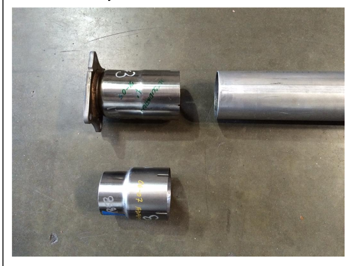
Step 2. Before installing your new system select the correct inlet adapter for your vehicles year. The larger adapter with the flange attached covers '01 - '05, the slip adapter covers '06 - '07. Attach the appropriate adapter by either bolting it to he vehicle outlet using the OEM fasteners or inserting the adapter into the slip clamp and loosely securing.