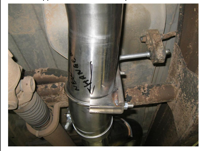
Step 4. For Short Bed models 13.00" needs to be cut from the outlet end on the Extension Pipe Assembly. Assemble and attach the U-Bolt Hanger assembly to the Extension Pipe Assembly as shown. There is a welded hanger on the pipe assembly that isn't used for Crew Cab, Short Bed versions of this truck. Loosely attach the Extension Pipe Assembly to the Mid Pipe Assembly using the supplied 4.00" Torca Clamp.

Once the appropriate cut has been made you can now loosely attach the Mid Pipe Assembly to the Inlet Adapter with the supplied 4.00" Torca Clamp.