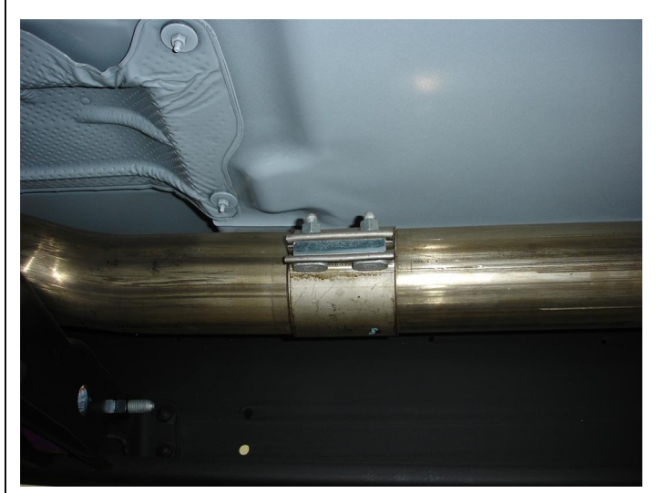
Step 1. To begin the removal of the OEM system you will need to unfasten the inlet. For vehicles '01 - '05 you will need to unbolt the inlet flange. For vehicles '06 - '07 there is a slip clamp that needs to be loosened. You can then disengage the welded hangers from the rubber insulators, working rearward finish removing the system. You may need to cut the OEM system to ease the removal process. Do not damage or discard the OEM fasteners and rubber insulators, as they will be reused to mount the new system.