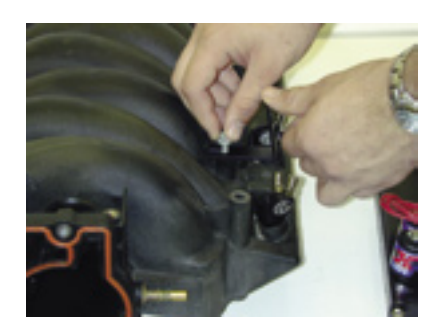
7. Now place the injectors in the fuel rail. You will need to lubricate the injector o-rings with some WD-40 or some other automotive lubricant to keep them from splitting upon reinstall. After that the NXL nozzles will need to be placed into the intake manifold. Once again be sure and lubricate their o-rings as well. Then, using the factory fuel rail mounting studs, install the NXL fuel rail mounting brackets. Make sure to leave them a little on the loose side to ease the installation.

*Note: It may be easier to install the NXL nozzles on the injectors before installing them into the intake in a tight fitting application.