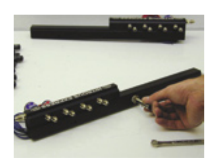
6. The rail fittings are installed in house. Then the rails are pressure checked to ensure a proper seal,. The fuel fitting must be installed next. It is located on the drivers side rail directly in the center. As with all pipe-thread fittings you must use NX thread sealer on all threads.