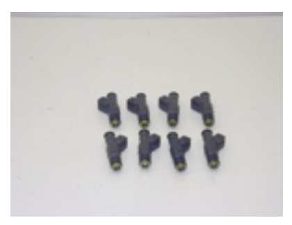
5. Flip injector rail over. This will allow you to remove injector lock clips. Once you have removed the clips take the injectors off of the fuel rail. Then inspect both o-rings on every injector. If the o-ring has the slightest tear or cut, replace before reinstalling.