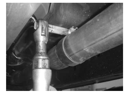
8. Using the 15mm socket and ratchet, loosen the clamp that secures the muffler assembly to the resonator/intermediate pipe.