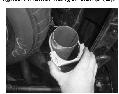
17. Install exhaust clamp (H) loosely over tail pipe (C). Do not tighten at this point.