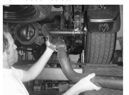
7. Remove tail pipe from the rear of the vehicle.