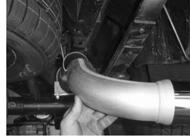
18. Install turnout w/ tip (D) at the end of tail pipe (C).