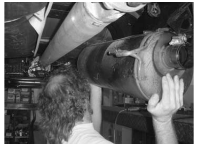
10. Remove factory muffler assembly.