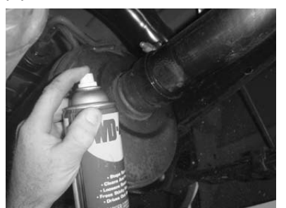
4. Spray lubricant on the exhaust pipe behind the muffler.