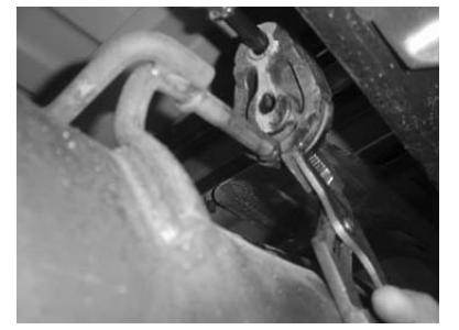
9. Remove muffler hangers from rubber isolators.