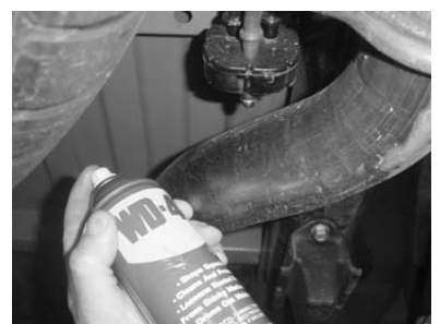
5. Spray lubricant on all factory rubber isolators.