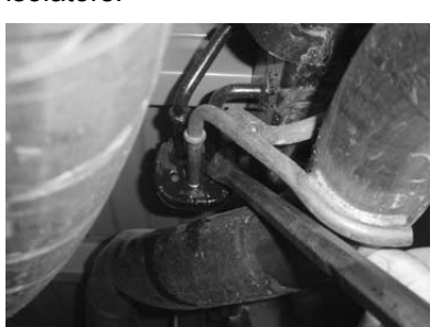
6. Remove the factory tail pipe hanger from rubber isolator.