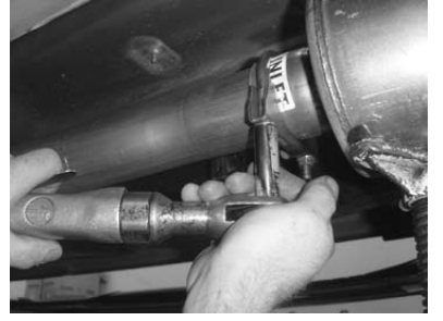
13. Insert muffler (B) into intermediate pipe (A). Place exhaust clamp with hanger(G) at the front of the muffler. NOTE: Support the muffler temporarily, until the muffler hanger clamp is used.