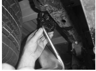
19. Insert turnout w/ tip and hanger into rubber isolator at the rear of the vehicle, near the spare tire.