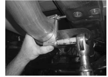
12. Install intermediate pipe (A) and secure with exhaust clamp (G).