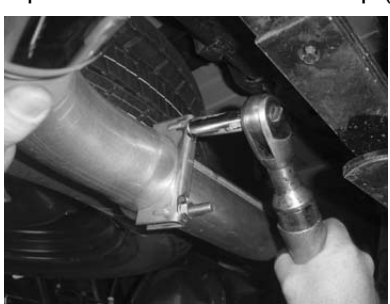
21. Align exhaust tip (D) properly and tighten clamp (G).