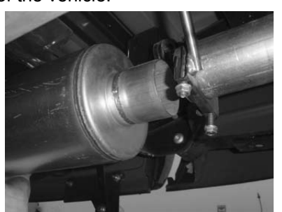
15. Insert tail pipe (C) through muffler hanger clamp (E) and into muffler (B).