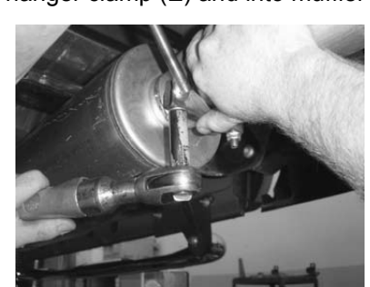
16. Align tail pipe (C) properly and tighten muffler hanger clamp (E).