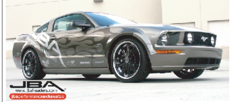
2005 Mustang GT JBA Project Vehicle See more pictures of this car at www.jbaheaders.com