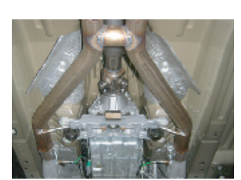
JBA Off-road H-pipe Part No. 6675SH