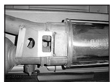
12. Completely weld the front of the muffler (A) to the converter pipes. Install the gusset filler plate (F) and weld in place.