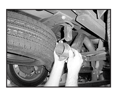
8. Slip tail pipe hanger clamp (E) over tail pipe (B) and insert hanger into factory rubber isolator.