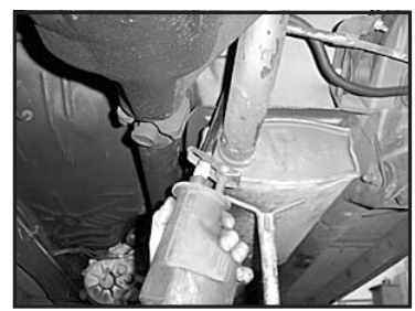
3. Using the reciprocating saw, cut tail pipe at the rear of the muffler. Remove tail pipe.