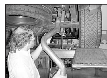
6. Install tail pipe (B) from the rear of vehicle.