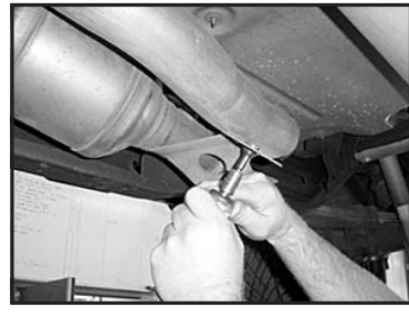
4. At the front of the muffler, cut through the welds and gusset. Remove muffler. Cut left side of gusset loose to allow for adjustment later.