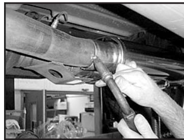
5. Install new muffler (A). Slip muffler onto converter pipes with minimum overlap. Tack weld in place.