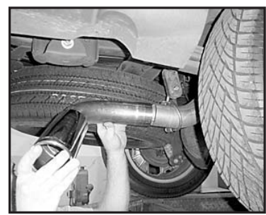
10. Slip tip (C) onto tail pipe (B).