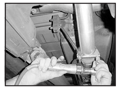
9. Install muffler hanger clamp (D) at the rear of the muffler. Align tailpipe (B) properly and secure.