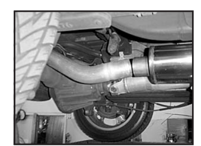
7. Insert tail pipe (B) into muffler (A).