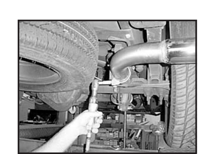
11. Align the tip properly and tighten clamp.