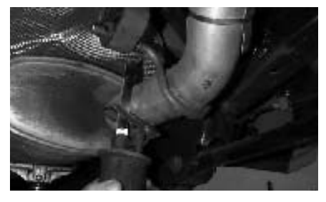
3. With vehicle raised and properly supported, using a reciprocating saw or hack saw, cut the tail pipe approximately 3" behind the muffler.