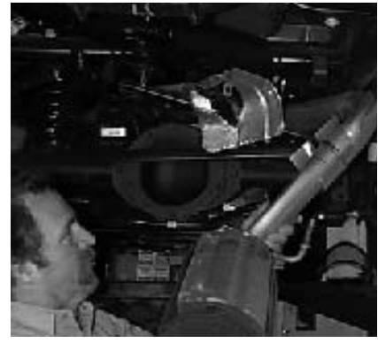
9. Remove the tail pipe and rear