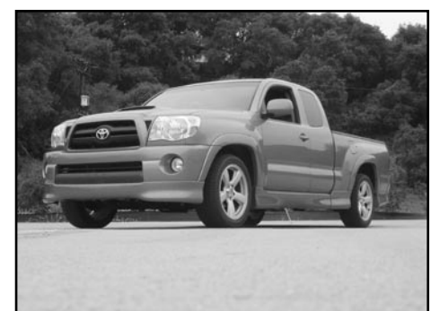
JBA Equipped - 2005 Tacoma X-runner 4.0L V6 5spd