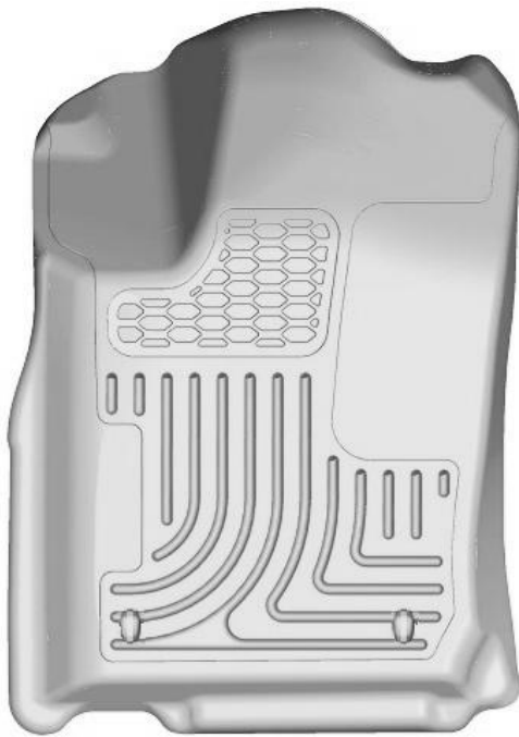
LEFT OR DRIVER'S SIDE