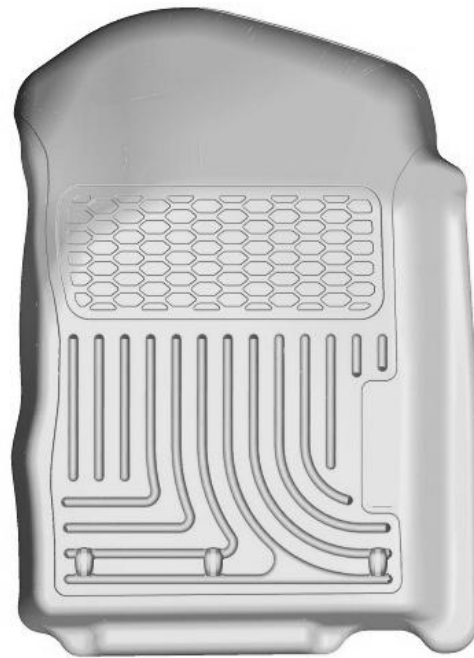
RIGHT OR PASSENGER'S SIDE

TO EASE INSTALLATION OF YOUR NEW DURANGO / GRAND CHEROKEE FRONT LINERS, FIRST MOVE BOTH OF THE FRONT ROW SEATS ALL THE WAY BACK SO AS TO ALLOW THE MOST LEG ROOM. ONCE YOU HAVE INSTALLED YOUR LINERS, REPOSITION THE FRONT SEATS AS DESIRED.