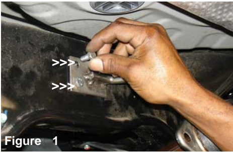
Figure 1 Line up the new plate hanger to the center of the rear axle and use the two m8 bolts.

Note: The installation of this axle back exhaust system does require mechanical skills. Injen strongly recommends that this system be installed by a professional mechanic. Start the installation by removing a portion of the exhaust system from the rear axle-back.