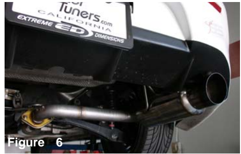
Figure 6 Align the entire axle-back for best fit and tighten the nuts and bolts, keep tip away from the bumper.