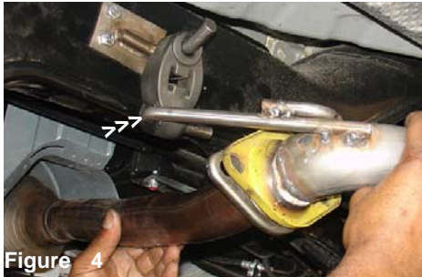
Figure 4 Push the second hanger near the flange into the second grommet as shown above.