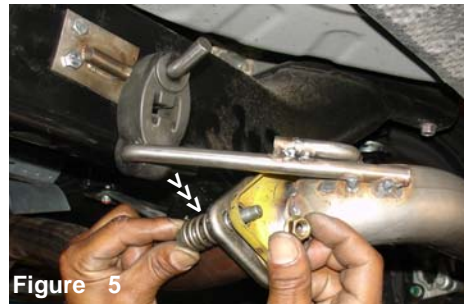
Figure 5 align the flange to the stock donut flange and use the stock spring loaded bolts and m10 nuts supplied.