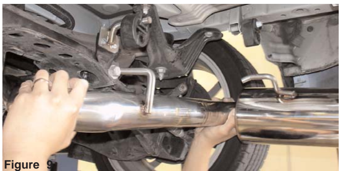
Figure 9 Align and place all three hangers underneath all three grommets.