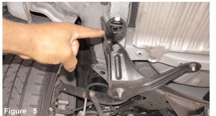
Figure 5 Remove the donut or grommet from the stock hanger located on the driver side rear axle.