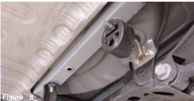
Figure 8 Bottom view of the new grommet location.