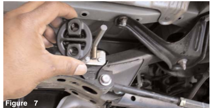
Figure 7 The stock grommet is inserted into the new hanger located on the passenger side rear axle.