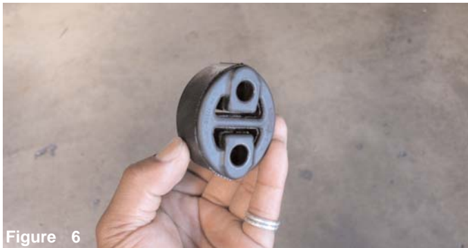
Figure 6 Donut or grommet removed from the stock rear hanger.