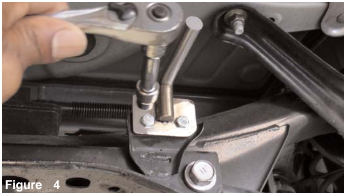
Figure 4 The two m6 x 16mm bolts are used to secure the hanger bracket to the rear axle brace. This hanger bracket is fastened on the passenger side rear axle.