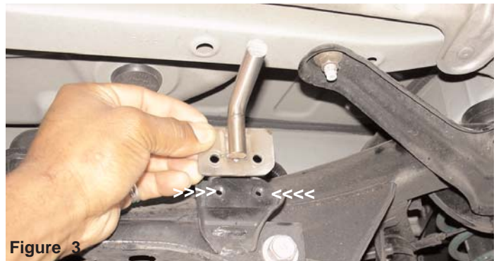
Figure 3 Holes are lined up to the pre-drilled holes on the rear axle brace.