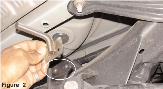
Figure 2 Place hanger bracket against the stock brace located along the rear axle